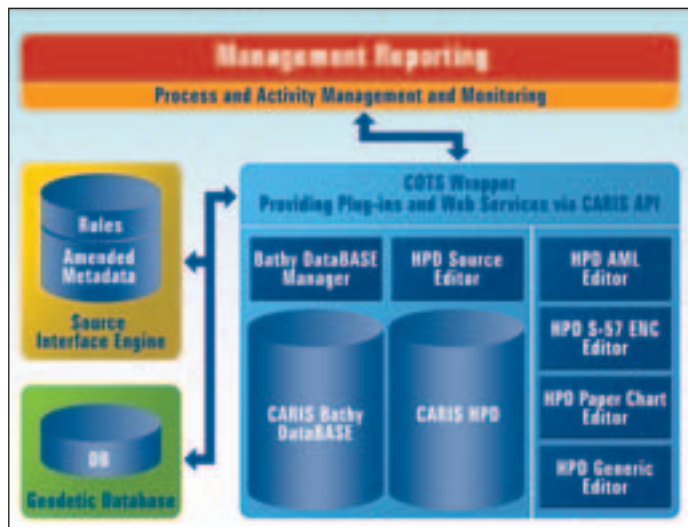
Figure 1 - Hydrographic database architecture