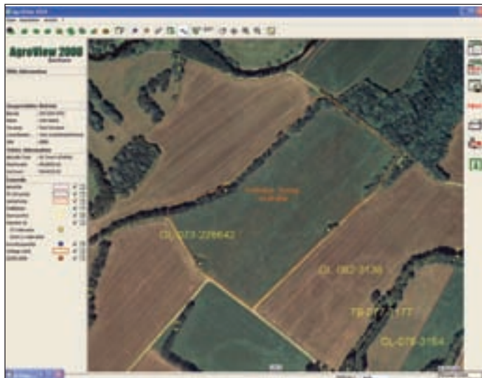
Parcel boundaries overlaid on imagery in AgroView