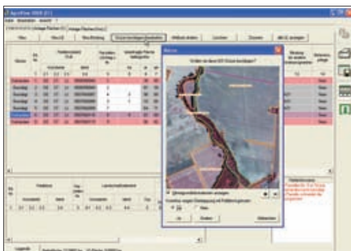
AgroView parcel data table with overlay

applications in recent years, which is the result of using AgroView® in Saxony. With the “Application CD” project in Saxony, the acknowledged high standards of GAF in the GIS field have melded optimally with the further requirements of application filling, such as form design and complex plausibility checks. As a result, the “Application CD” is a real “all-rounder” and acceptance by farmers is very high. In particular, farms with the juristic person legal form couldn't imagine still filling solely paper-based applications. Every year in March the “silver disk” from Munich is therefore veritably longed for by farmers.